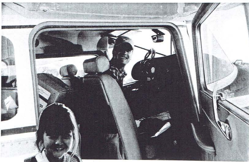
"Broce" from Wings of Faith