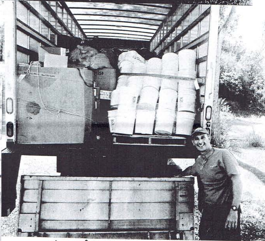
Wings of Faith Truck Delivery