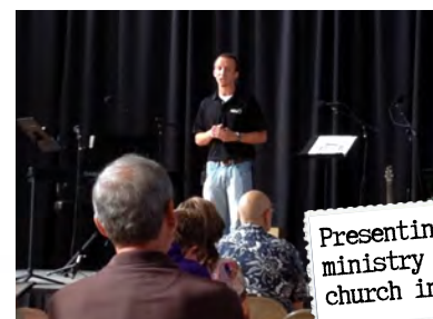
Presenting our ministry at a church in June