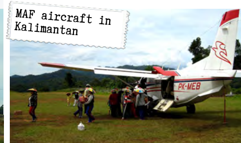
MAF aircraft in Kalimantan